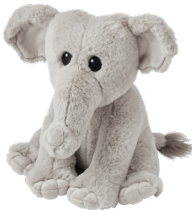
Small Elephant Plush