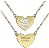
Embrace Possibility Necklace