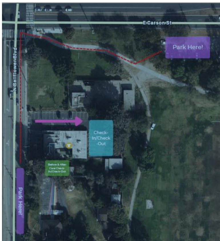
Map of El Ranchito. Please Reference for parking and camper drop off and pick up.

Health forms must be 100% completed prior to your camper attending camp.