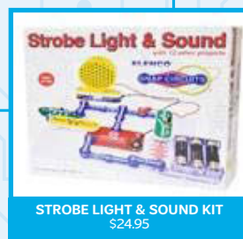
STROBE LIGHT & SOUND KIT $24.95