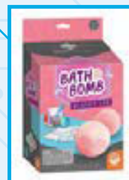
BATH BOMB SCIENCE LAB $9.95