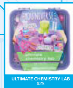
ULTIMATE CHEMISTRY LAB $25