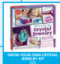
GROW-YOUR-OWN CRYSTAL JEWELRY KIT $23