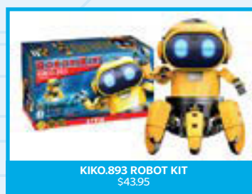
KIKO.893 ROBOT KIT $43.95